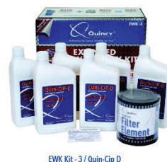
EWK Kit - 3 / Quin-Clip D