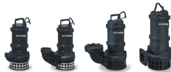
50AL21.5 50AL22.2 80AL21.5 80AL22.2 80AL23.7 100AL25.5 100AL27.5